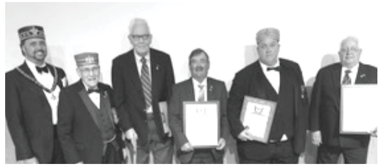
Brethren Who Were Recognized For Longevity In The Fraternity. Congratulations To All!

Such is the case before us now. The Executive Board has discussed and decided that the KSA should NOT have a voting seat on the Board. There was ample discussion and the majority of the board felt that the KSA is an important part of the Valley, but it is a "service" part, not necessarily a leadership part. Thus, if approved, the by-laws will delete the Venerable Master, Knights of St. Andrew as a voting member of the Executive Board as listed in Article III, Section e, sub-section 1.